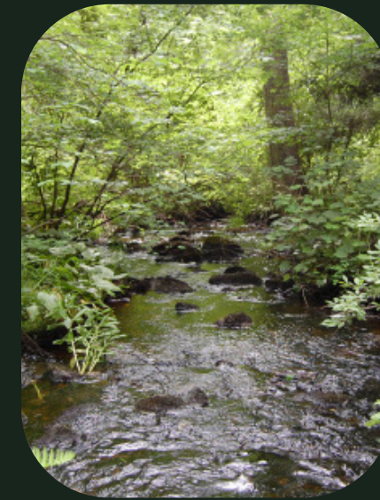
Gregg Preserve 92 acres