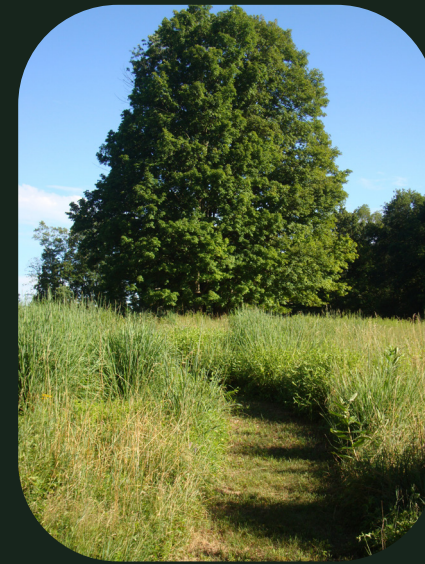
Chestnut Meadows 13.5 acres