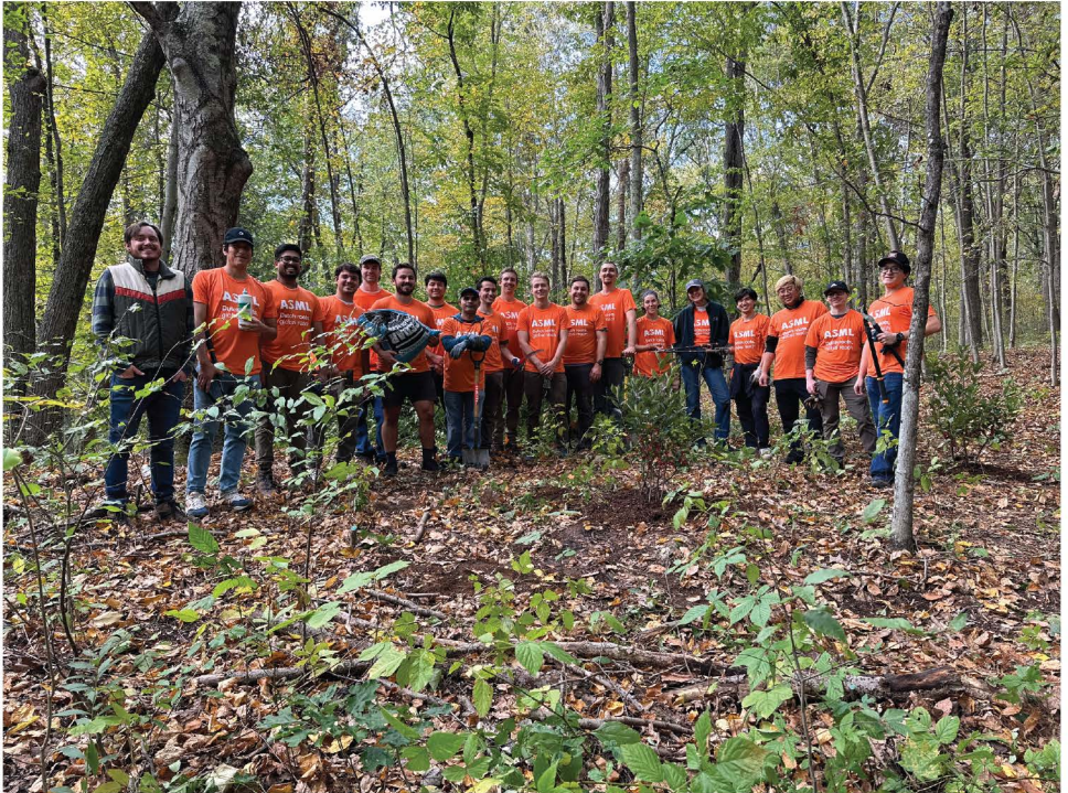
ASML & Wilton Land Trust, Forrest & Habitat Restoration Workday

In Connecticut, we work with the Wilton Land Conservation Trust to improve open space amenities and restore biodiversity. We removed invasive plant species and planted native plants and trees to support birds and wildlife at the Eugenia Slaughter Native Wildflower Meadow and Schencks Island in Wilton.