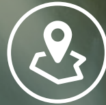
LAND OR EASEMENTS